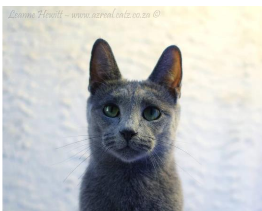
Esky Nagasaki - 1 st Place - Winner

Our Top 5 ended up being more than just 5 Russians. We had 3 Russians sharing 5 th place. Let's introduce you to the winning Russians.