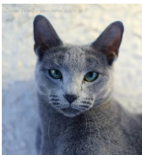
Azreal Lascivious Lyanna – 5 th Place