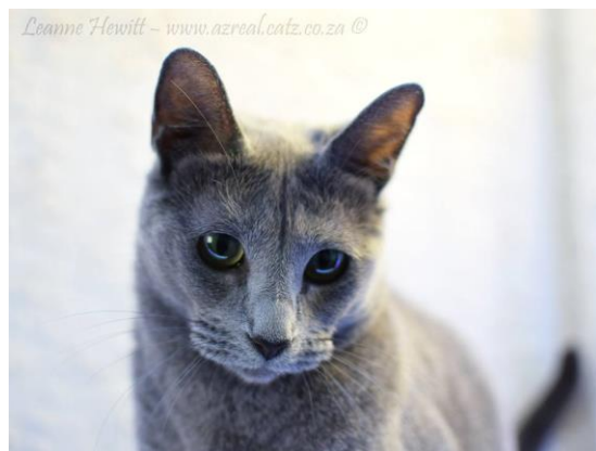
Azreal Ayla Amour Aurora – 3 rd Place