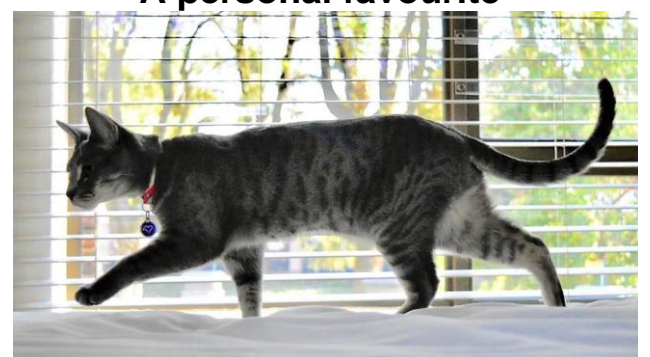
How beautiful is this Russian Blue Spotted Tabby? Davante Chantilly