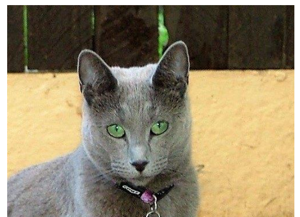
Silversheen Alaska Ciara – 5 th Place