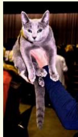
Azreal Sashina Saharz – Top 5 Kittens